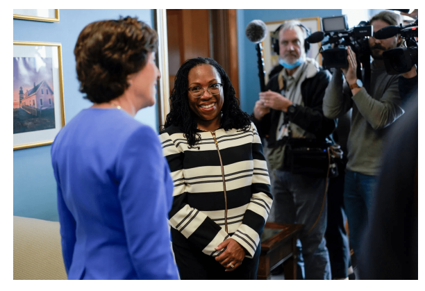
Supreme Court nominee meets with US Senator (March 2022)

Ted Cruz For President campaign caught using Photoshopped image (<u>Source</u>)