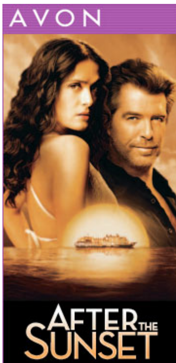
AVON BREAKS NEW GROUND WITH SALMA HAYEK PROJECT Company Launches First Cross-Promotional Film Deal November 01, 2004 By T.L. Stanley