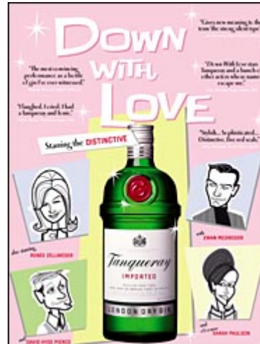
A Tanqueray gin print ad ties into the movie "Down With Love."

Read about the product placement in the movie.