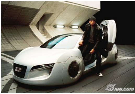
Will Smith in "I, Robot" with Audi car