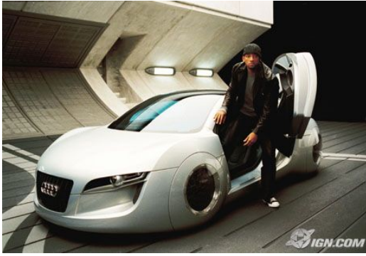
Will Smith in "I, Robot" with Audi car