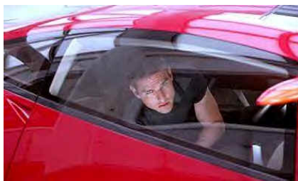
Actor Tom Cruise drives a futuristic Lexus in Minority Report .

Read about the product placement in the movie.