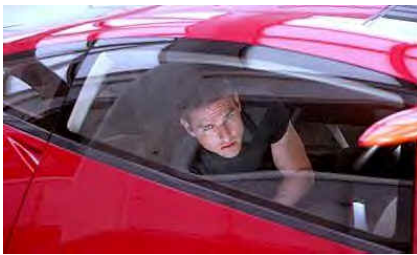
Actor Tom Cruise drives a futuristic Lexus in Minority Report .

Read about the product placement in the movie.