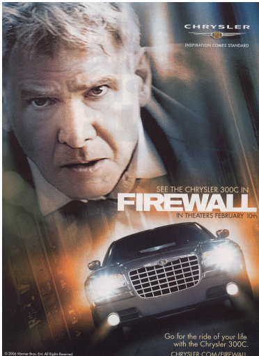
Harrison Ford drives Chrysler in new film Firewall