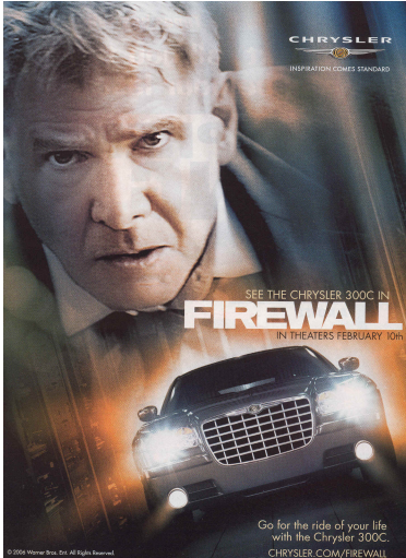
Harrison Ford drives Chrysler in new film Firewall