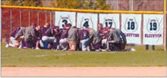
Members of Bluffton University's baseball team gather in prayer before their first home game Friday at the school in Bluffton. Banners were hung in the outfield with the names of each member of the team who was killed in or after the crash in Atlanta.