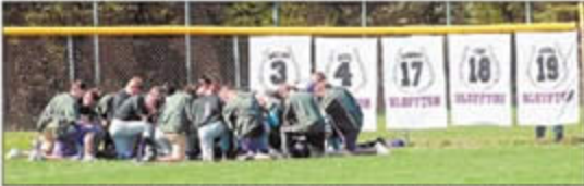
The Bluffton University baseball team poses near the numbers of their fallen teammates before the start of their first game back since a deadly bus accident in Atlanta.