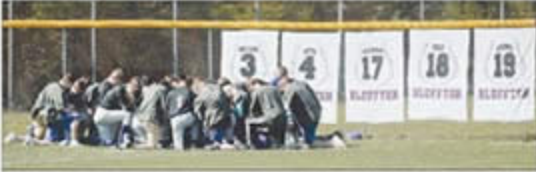
Bluffton baseball team members pray before the start of their season opener Saturday at the school in Bluffton.

SOMETHING IS MISSING. In photographs in the Cleveland Plain Dealer, the Dayton Daily News, and The Lima News, a pair of legs can be seen behind the banner hanging on the outfield fence (on far right). In the photograph in the Toledo Blade, the legs are missing.