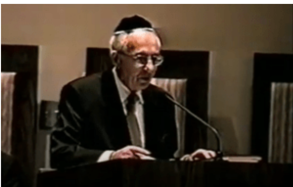
Frame grab from the 2000 speech

And for those who wish to watch/listen to the original speech , as it was captured that day, digitized, it is here as well.