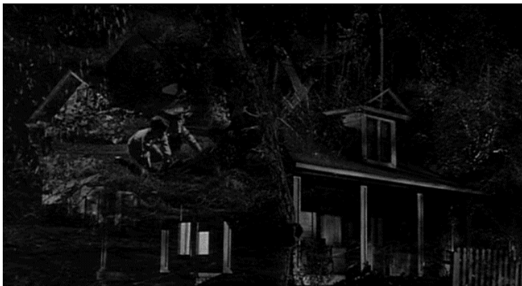
2 the dissolve begins: and we can see the children slowly begin to appear in the left center middle of the frame