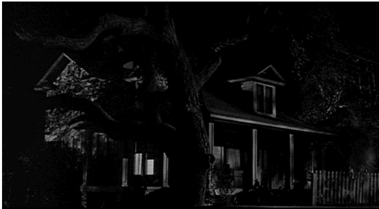
1 we see the house in a static shot

The scene to notice here starts at 25:13: Notice how the frame slowly dissolves between the shot of the house, to the shot of the kids approaching the house. Here a dissolve indicates the passage of time, and change of location.